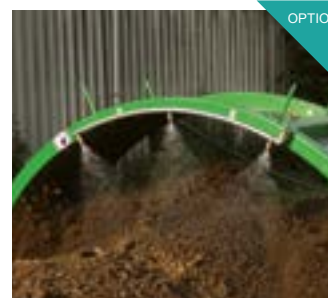
Water sprayer with nozzles. To achieve an optimal microorganism climate within the mound, the addition of water is essential.